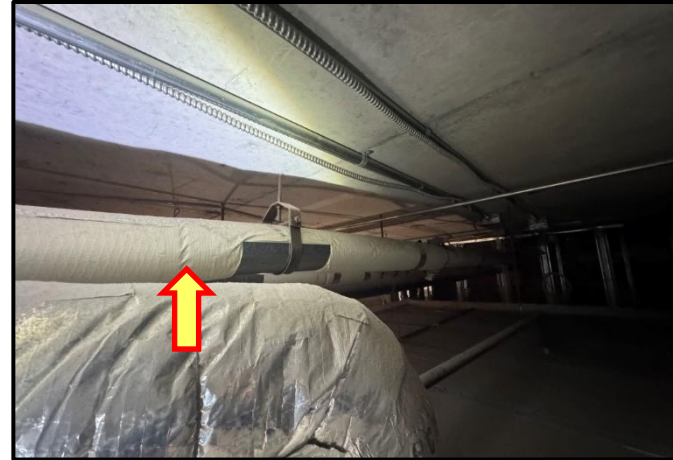
Photograph 2: View of non-asbestos fiberglass insulation observed on mechanical pipes within ceiling spaces throughout the building.