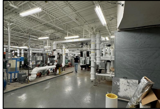
Photograph 6: View of mechanical penthouse B.