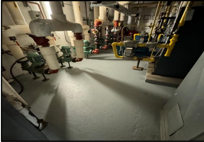
Photograph 5: View of the boiler room.