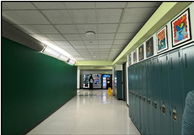
Photograph 3: Typical view of the corridors observed throughout the building.