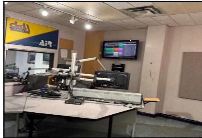
Photograph 8: Typical view of the studio spaces observed throughout Room N101.