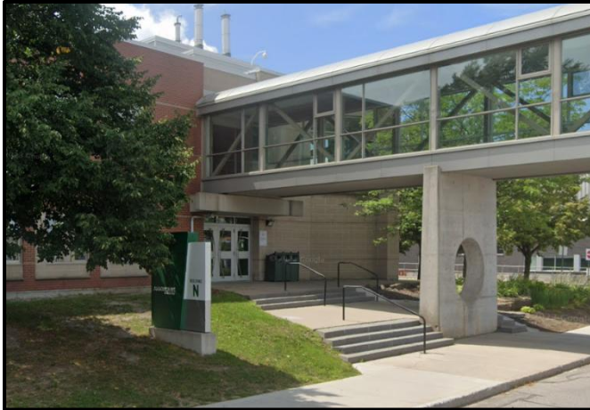
Photograph 1: Typical view of the exterior of the building.