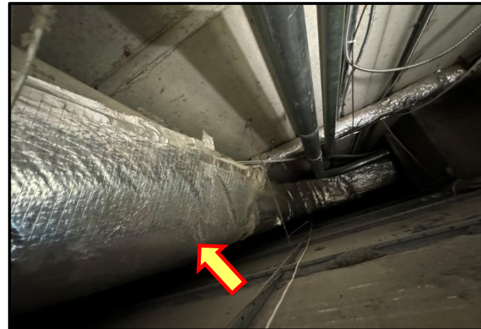
Photograph 4: View of non-asbestos fiberglass insulation observed on ductwork within ceiling spaces throughout the building.