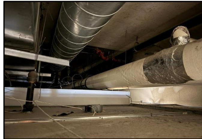
Photograph 8: View of mechanical pipes insulated with non-asbestos fiberglass observed in ceiling spaces.