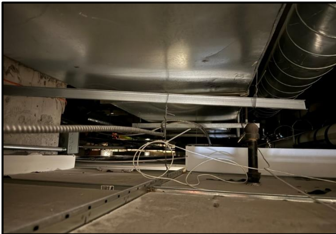
Photograph 7: View of uninsulated ductwork observed in ceiling spaces.