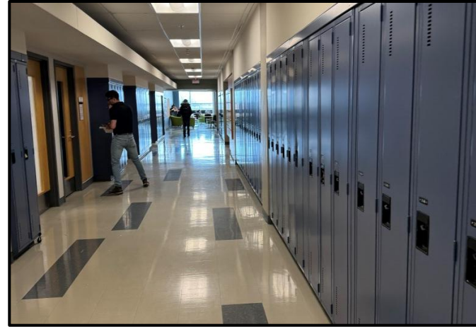
Photograph 6: Typical view of the third-floor corridor.