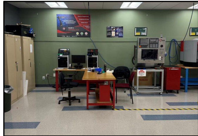
Photograph 4: View of Room T228.