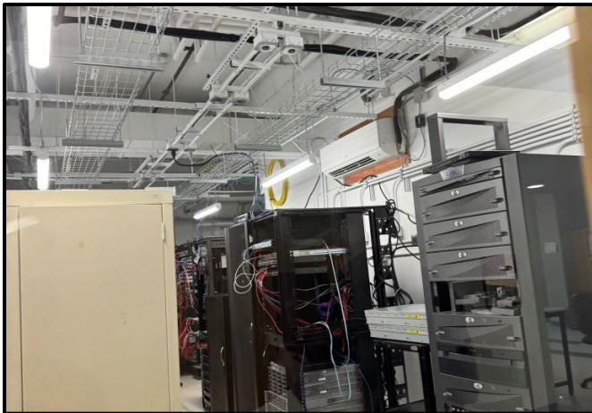
Photograph 3: View of Room T120.