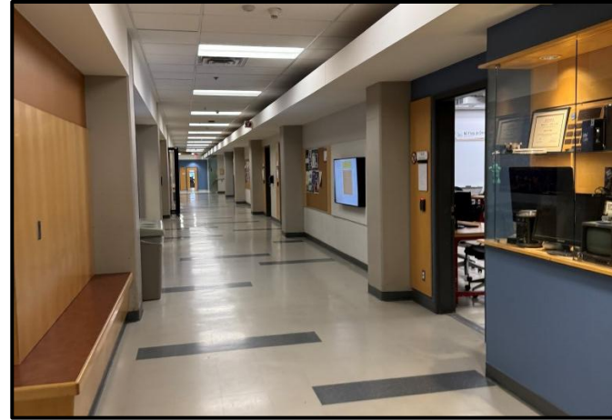
Photograph 2: Typical view of the first-floor corridor.