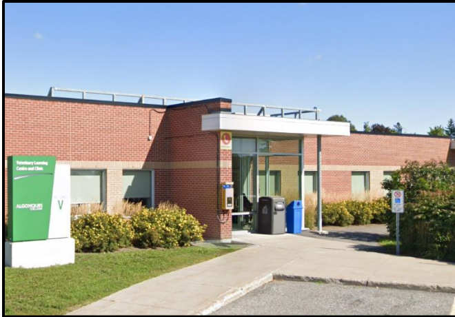
Photograph 1: Typical view of the exterior of the building.