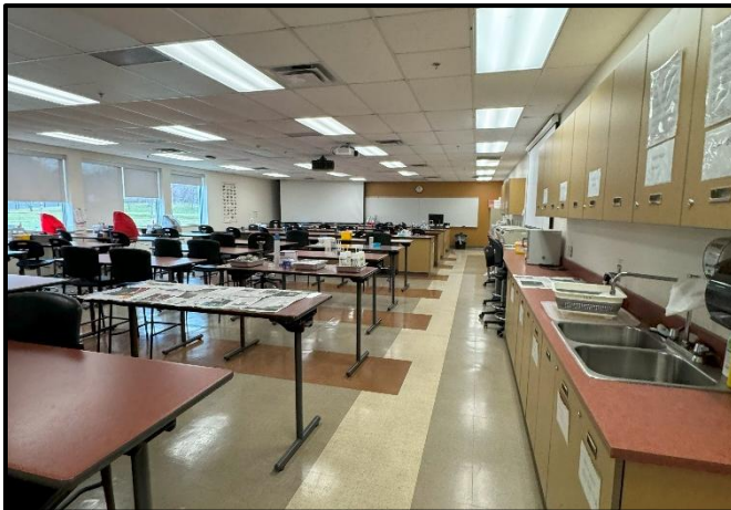
Photograph 3: View of classroom (V119).