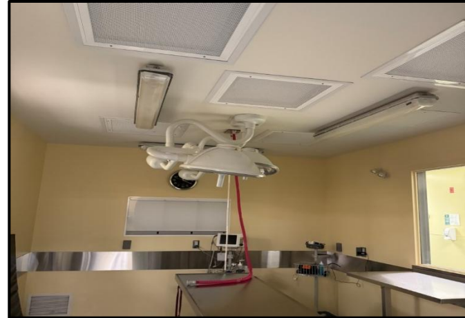
Photograph 6:View of the surgery facility located in Room V115e.