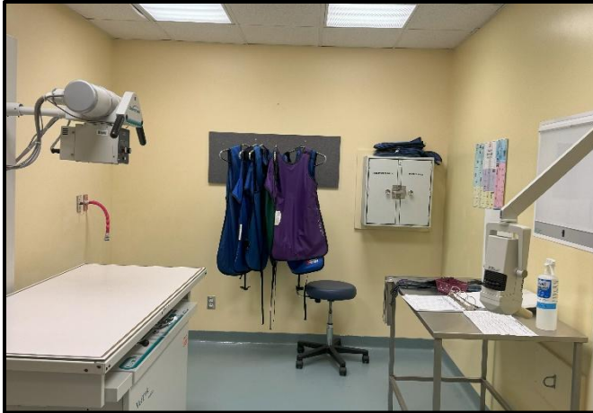
Photograph 5:View of the X-ray facility located in Room V115b.