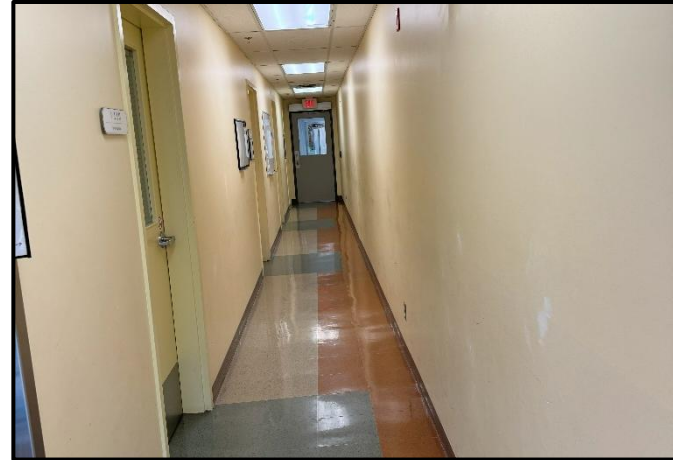
Photograph 2: Typical view of corridors observed throughout the building.