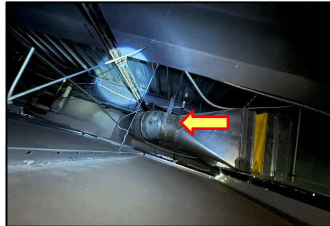
Photograph 4: View of non-asbestos mastic observed on ductwork throughout the building.