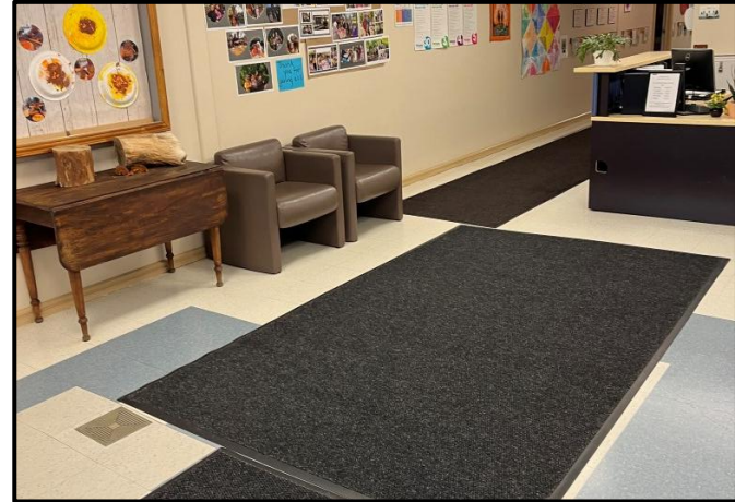
Photograph 2: View of main entrance reception area.