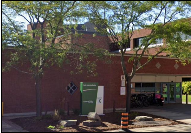
Photograph 1: Typical view of the exterior of the building.