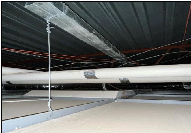
Photograph 3: View of non-asbestos containing fiberglass insulation observed on mechanical pipes throughout.