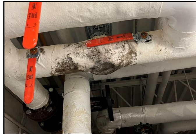
Photograph 4: View of suspect mould impacts on mechanical pipe fittings observed in the Mechanical Room.