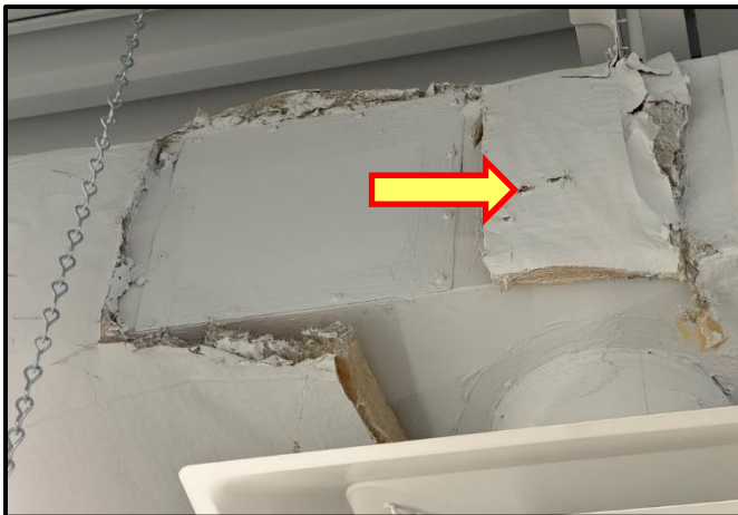
Photograph 3: Typical view of the non-asbestos fiberglass insulation observed on ductwork throughout the building.