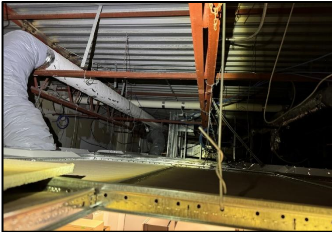
Photograph 5: Typical view of the ceiling spaces above the suspended grid system throughout the building.