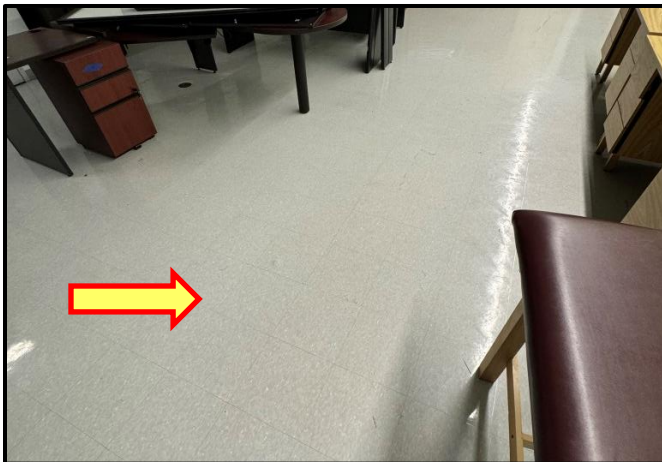
Photograph 7: View of the non-asbestos 12"x12" grey vinyl floor tiles with black and grey streaks observed in Room F102.