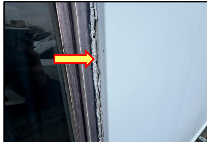
Photograph 8: View of asbestos-containing window caulking observed on exterior windows.