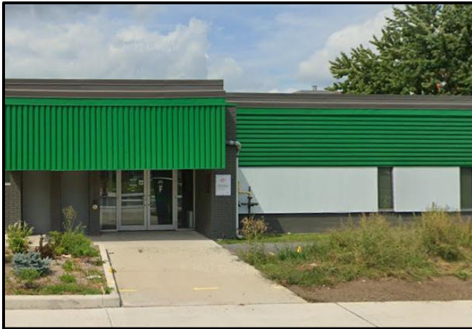
Photograph 1: Typical view of the exterior of the building.