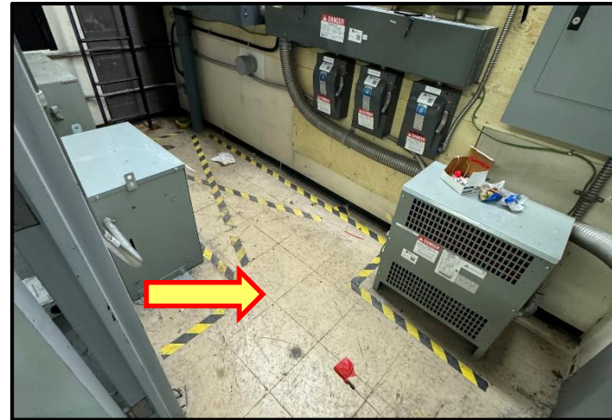
Photograph 2: View of the asbestos-containing 12"x12" beige vinyl floor tiles with white and black streaks observed in Room F113b.