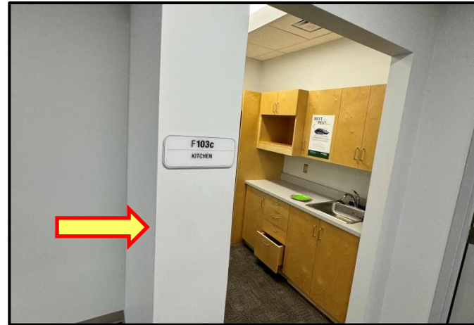
Photograph 6: View of non-asbestos containing drywall joint compound observed throughout the building.