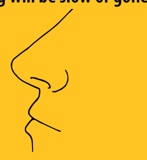
Person is not moving